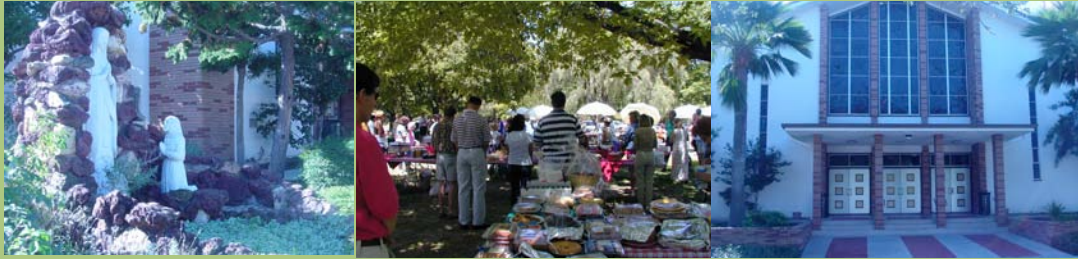
St. Mary's Church - Los Gatos, California